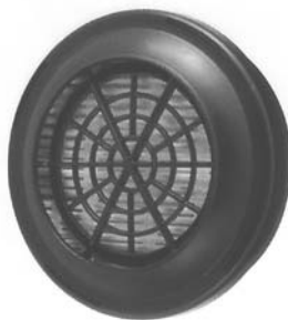
No. 7422-FE4 Filter Cover & Retainer