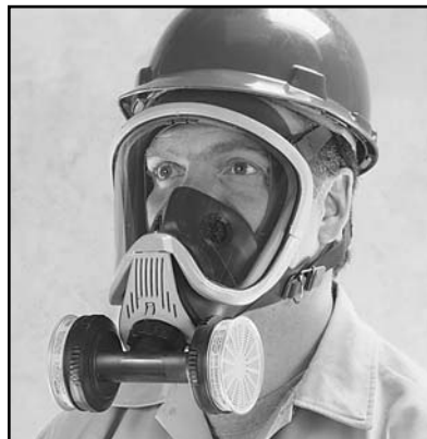
Ultra Elite Facepiece with optional Twin-Cartridge Adapter