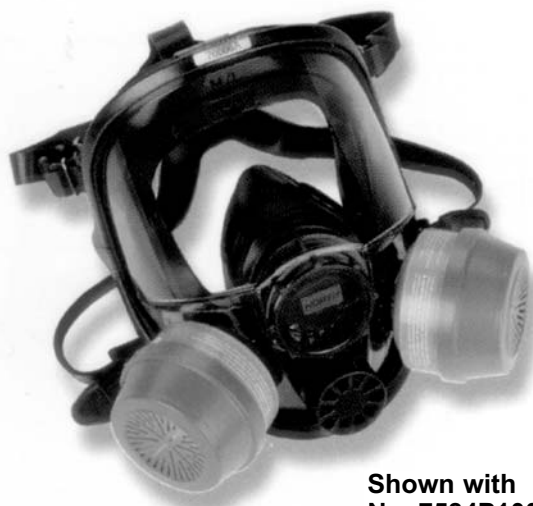
Shown with No. 7584P100 Cartridges

How to Order: A complete respirator requires a facepiece with appropriate cartridges and/or filters, as well as filter retainers and holders as specified on the facing page.