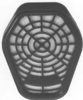
No. 7422-BA1 Cartridge