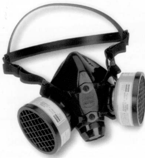
Shown with No. N7500-3 Cartridges