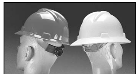
Fas-Trac® Ratchet Suspension System