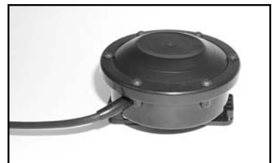
Large Hazmat Push-To-Talk Remote Button