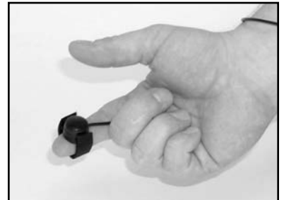
Ring Finger Push-To-Talk Remote Button